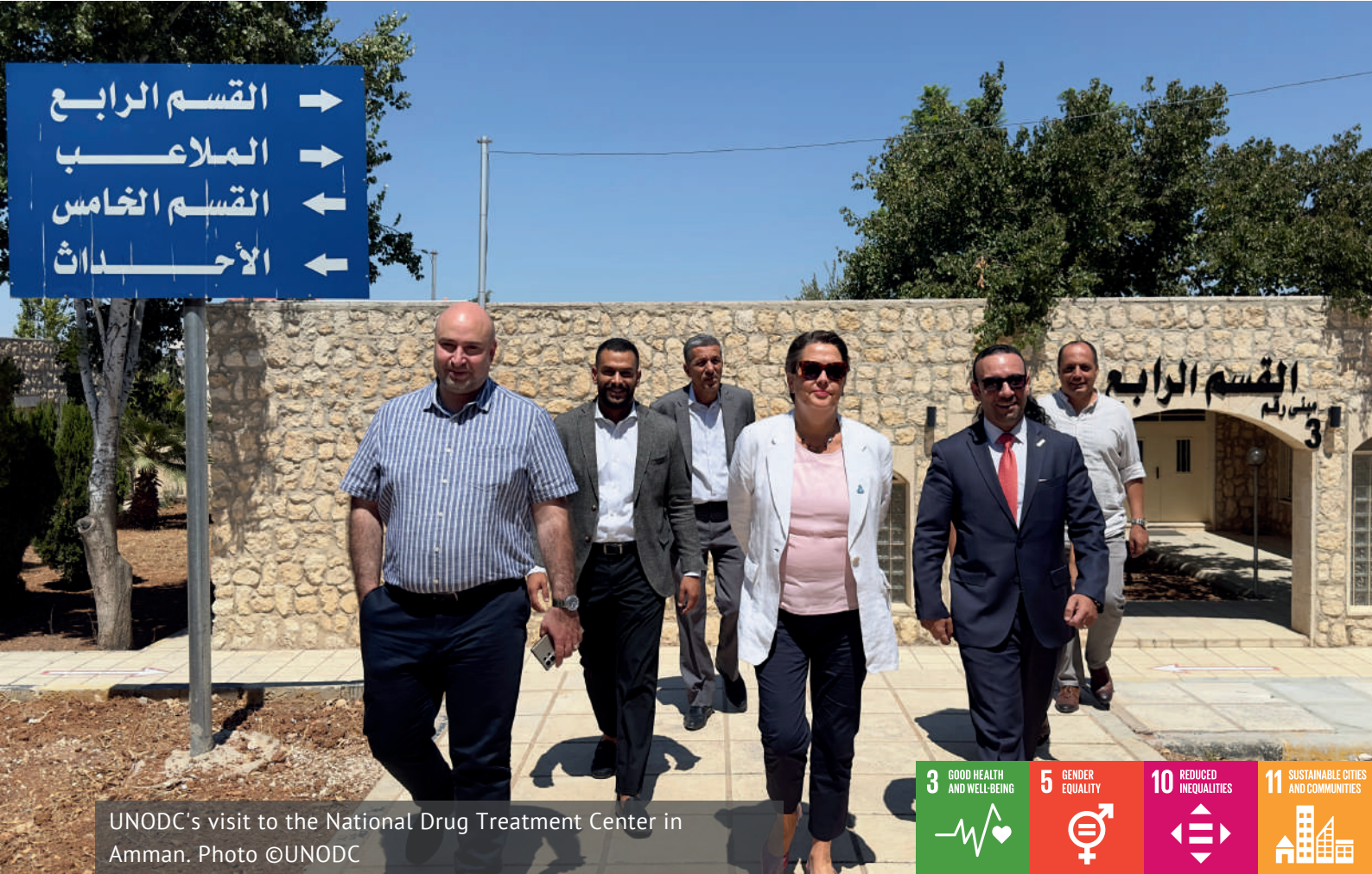
UNODC's visit to the National Drug Treatment Center in Amman.

Through the Middle East Harm Reduction Association (MENAHR), UNODC facilitated training sessions for Ministry of Health officials on the implementation, monitoring, and evaluation of the OAT Programme. This contributed to expanding harm reduction programmes in Jordan and contributed to operationalizing the new Opioid Agonist Therapy Center in partnership with the Ministry of Health.