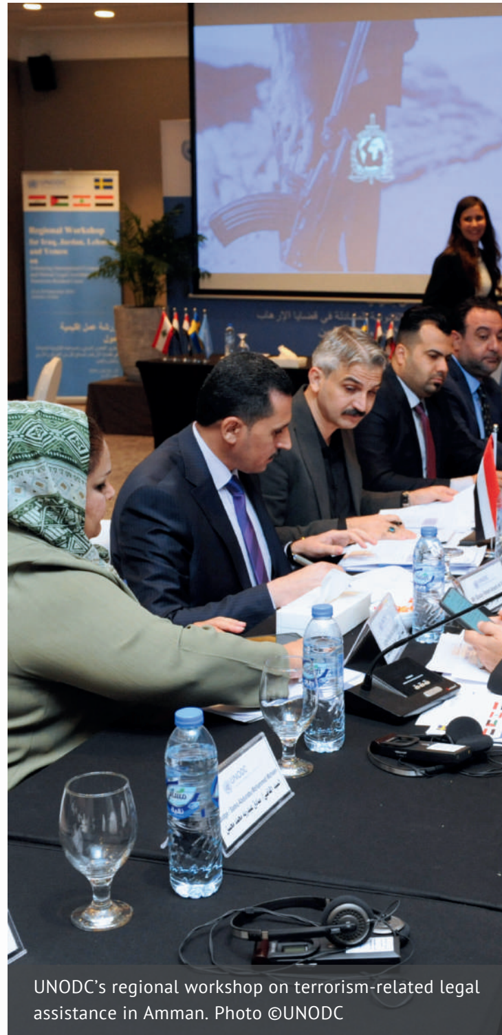
UNODC's regional workshop on terrorism-related legal assistance in Amman.

In 2024, UNODC organized a regional workshop in Amman on “ Enhancing International Cooperation and Mutual Legal Assistance in Terrorism-Related Cases ”, facilitating bilateral discussions among participating countries: Iraq, Jordan, Lebanon, and Yemen. Participants agreed on mechanisms to enhance and expedite cooperation in terrorism cases, including mutual legal assistance and extraditions, by utilizing both formal and informal channels of communication.