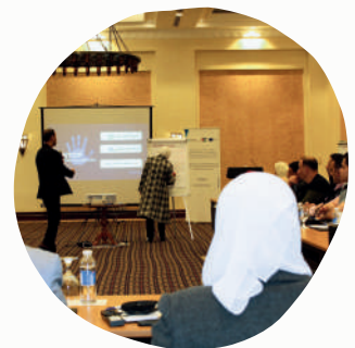
UNODC’s capacity building activities with national partners.

The “ Enhance Capacities to Fight Transnational Crime in Jordan ” project under the EU Action “ Support to Integrated Border Management in Jordan ” focuses on advancing the institutional capacity of the border agencies in detecting, investigating, preventing, and disrupting serious security and criminal threats including trafficking on Jordanian border crossings. In 2024, UNODC concluded the establishment of operation rooms at different border crossings and provided equipment and specialized training to advance inter-agency coordination and regional cooperation through the exchange of information.