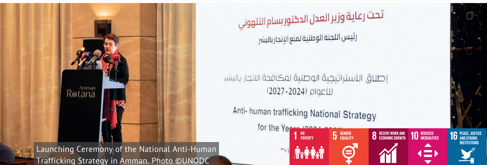
Launching Ceremony of the National Anti-Human Trafficking Strategy in Amman.

UNODC’s border management efforts focus on preventing TiP/SoM through specialized training for law enforcement officers. The PCCP programme equipped officers with risk management and profiling skills to identify and prevent TiP/SoM. In late 2024, UNODC organized advanced training for border officers on investigation techniques in TiP/SoM cases, as part of the project “ Enhance Capacities to Fight Transnational Crime ” under the EU Action “Support to Integrated Border Management in Jordan”.